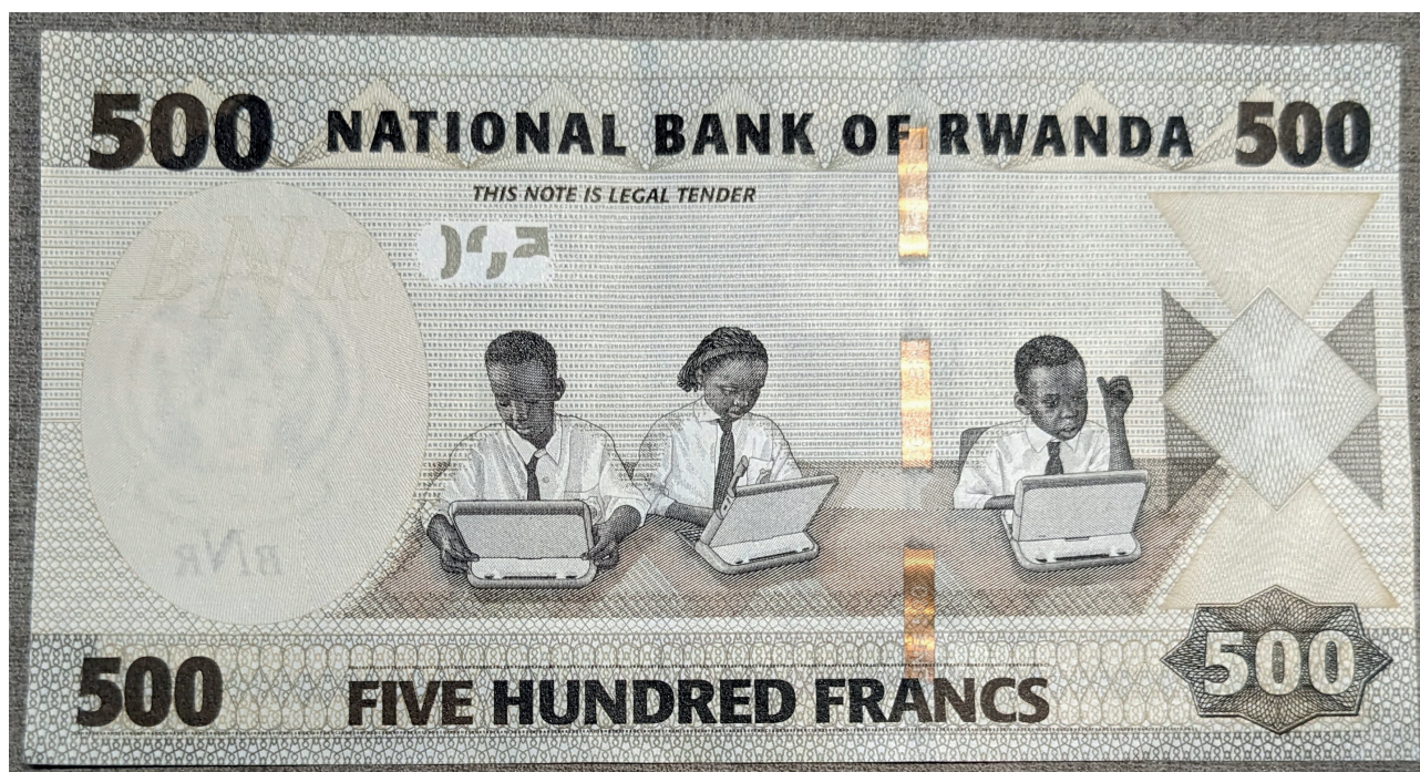
▲ A RWF500 banknote illustrating the importance of digitalisation in education in Rwanda

The formulation phase of the project included the distribution of 3,000 laptops to TVET teachers. This early action demonstrates a proactive approach to equipping teachers with the necessary tools, allowing them to follow an online training on digital literacy and digital pedagogy, and sets a solid foundation for the project's future success. Notably, the laptops were delivered in successful collaboration with Post Luxembourg, which was selected after an open call for tender.